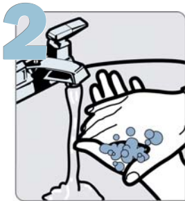
Wash your hands.